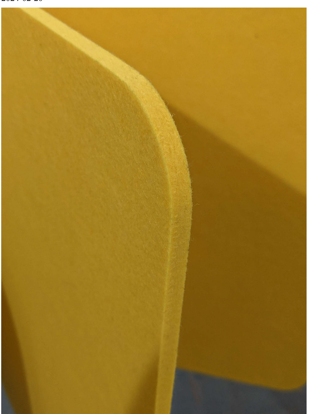
Figure 3 – Detail of specimen material